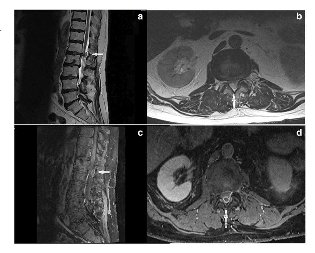
Fig. 1 MRI. (1a) Sagittal T2weighted image. (1b) Axial T2weighted image showing a posterior mass at level L1–2. (2a, 2b) Sagittal and axial T1-weighted image with contrast showing a ring enhancement (Elsharkawy 2018)

The differential diagnosis includes conditions with features similar to posterior epidural mass, which include degenerative (synovial cyst, and facet joint osteophyte), infective (epidural abscess), neoplastic (meningioma, metastasis, lipoma, lymphoma, hemangioma), and miscellaneous pathologic processes (postoperative fibrosis) [25, 61].